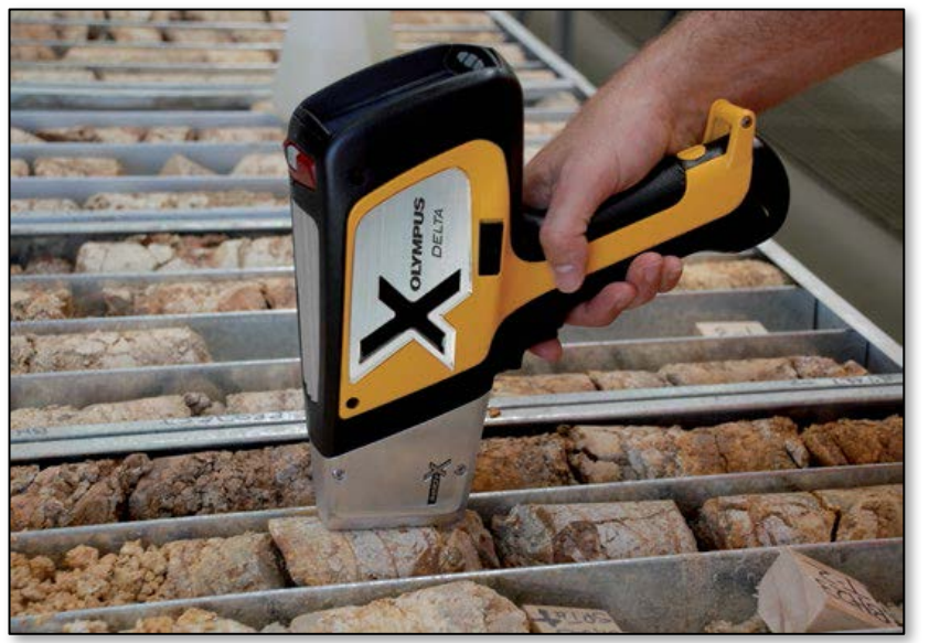
From pXRF Application Notes, 2017, www.olympus-ims.com/en/applications/field-portable-xrf-shale-gas/